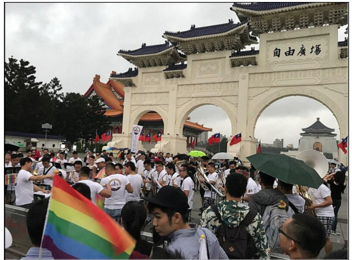
Image: Marchers at Taiwan's 2016 Gay Pride March, just outside Taipei's Liberty Square (October 2016).

The inauguration of Democratic Progressive Party (DPP, 民進黨) president-elect Lai Ching-te (賴清德) took place on May 20,