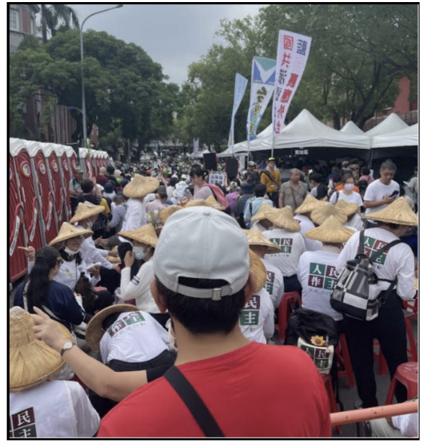
Above: Traditional activist groups helping to share resources during the "Bluebird" protests. Below: Signs and reminders are everywhere to warn the activists not to get out of control and rush into the LY.

One legacy of the Sunflower Movement is the emergence of closer ties between young activist groups in Taiwan and the region. In the past few years, activists in Southeast Asian countries have kept contact and maintained close interactions with Taiwan's activist groups and counterparts, including in the Bluebird Movement. Indeed, the Bluebird Movement can be regarded as the most influential culmination of recent advancements in digital technology and growing regional partnerships. Many activists from Southeast Asian countries and Hong Kong came to