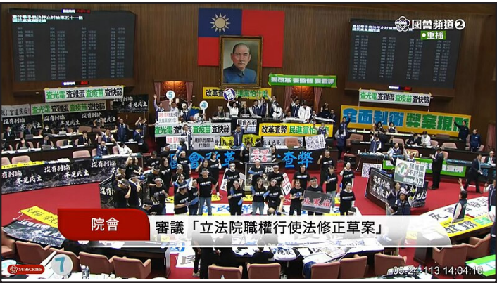
Image: The floor of the Legislative Yuan, with legislators displaying contending signs supporting or opposing the draft amendment on the LY’s oversight authorities (May 24, 2024).

tation No. 585 (法院大法官釋字第585號解釋) issued in 2004, addressed the scope and limitations of the LY’s investigative powers. The Court recognized the importance of investigative authority for the Legislative Yuan to effectively fulfill its legislative duties. Underscoring the need for the LY to respect the authorities of other government branches—particularly regarding executive privilege—the interpretation emphasized that the LY’s power is not absolute and must be exercised within the bounds of the Constitution. Additionally, the Court advocated for resolving disputes concerning the scope of investigative power through negotiation or judicial review. Despite the LY already having investigative powers, why has the bill proposed by the KMT/TPP drawn so much controversy ?