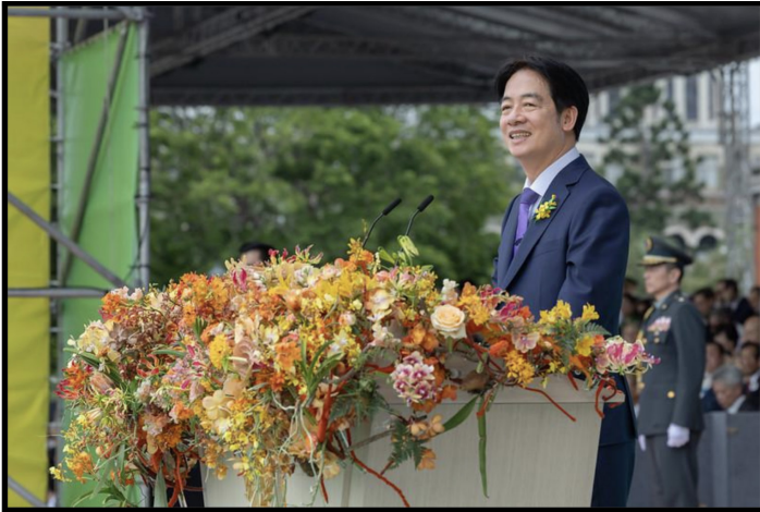
Image: ROC President Lai Ching-te delivering his inaugural address in Taipei, May 20.

proposal that Beijing was not necessarily opposed to when the former premier pitched the framework back in 2012.