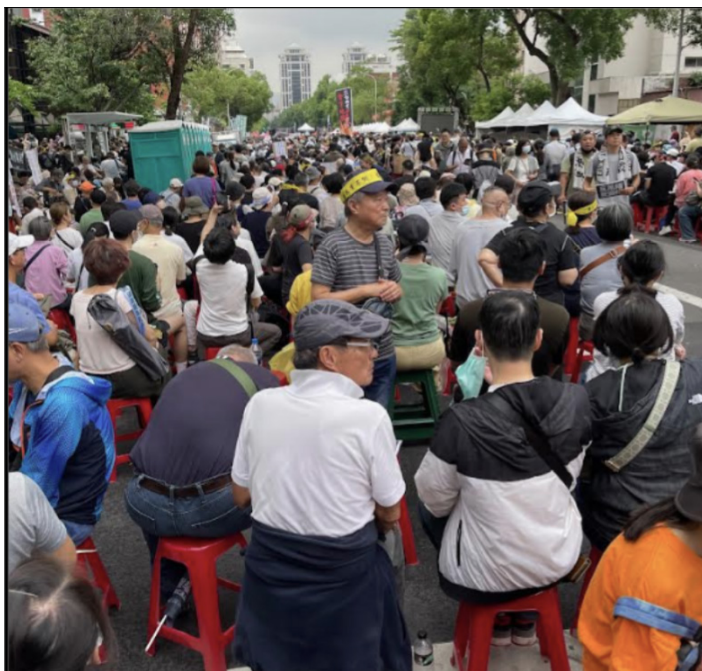
Image: Senior citizens from southern Taiwan joining the “Bluebird” protests outside the Legislative Yuan in Taipei (May 2024).

The first four characteristics are driving forces for enabling political and social changes, as well as propelling reforms within Taiwan. The fifth one demonstrates the unique political and civil society connectivity between Taiwan and Southeast Asian countries—in particular as shown in the “Sunflower Student Movement” (太陽花學運) of 2014 and the “Bluebird Movement” (青鳥行動) of 2024.