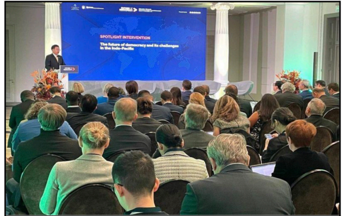
Image: Taiwan Foreign Minister Jaushieh Joseph Wu delivering an address at the “Future of Democracy: High Level Forum on Defending Against Authoritarianism” conference held in Vilnius, Lithuania on November 10, 2023. 21