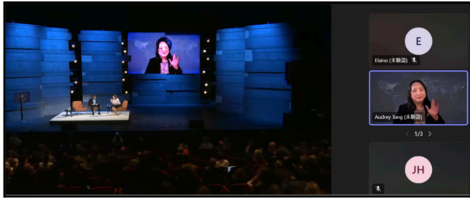
Image: Taiwan Minister of Digital Affairs Audrey Tang addressing the Copenhagen Democracy Summit via remote link in May 2024. 19

perience at the “Future of Democracy: High Level Forum on Defending Against Authoritarianism” held in Vilnius, Lithuania in November 2023. Speaking at the forum, Minister Wu stated: