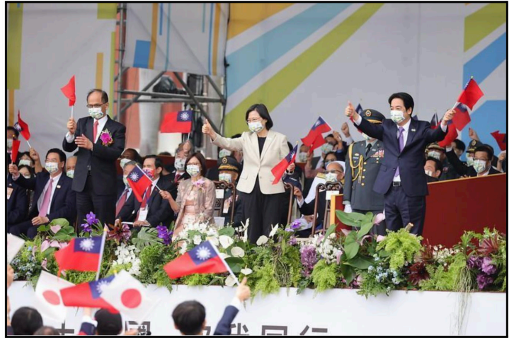
Image: Taiwan President Tsai Ing-wen (center) and Vice-President Lai Ching-te (right) in the reviewing stand for the 2022 National Day Holiday ceremonies. Tsai's speech that day placed a strong emphasis on Taiwan's role in the worldwide democracy movement. 13

This theme was reinforced in Tsai's Double Ten speech the following year, which also saw a noticeable narrative shift in terms of further emphasizing Taiwan's expanding ties with fellow democracies, and the importance of the global democracy move-