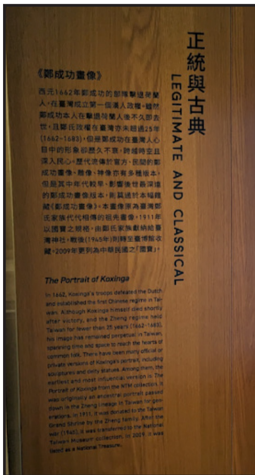
Image: Exhibit on Koxinga in the NTM.

The exhibit also effectively ignores Taiwan's indigenous population. Before ethnic Han Chinese began colonizing the island, control of Taiwan was in the hands of a large number of different tribes. Though there was no island-wide polity, Taiwan had been occupied for thousands of years by large numbers of Austronesian speakers. By framing the Dutch as the first unifying authority in the history of Taiwan, this exhibit effectively silences Taiwan's indigenous groups from the progression of history (though there is another section of the exhibition, outside of the linear narrative, where the curators provided several exhibits on Taiwan's indigenous population).