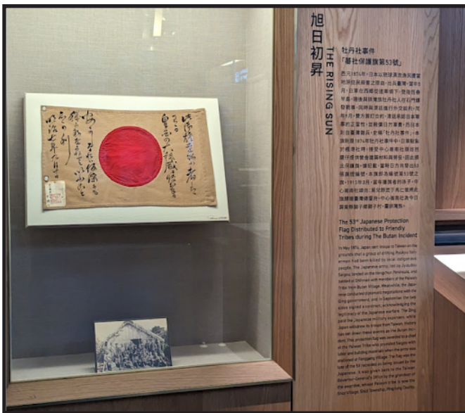
Image: Exhibit highlighting the history of Japanese colonization of Taiwan.

This example is not the only exhibit that highlights how fragile Qing control was over the island. Overall, there are several, including an exhibit on the French invasion of Taiwan in 1884. Even though there are exhibits which highlight both Qing control over the island and the tenuousness of that control, it was the characterization of the fragility of the Qing's control that tended to win out in the exhibition's representation of this period. This overarching characterization may result from curators' intentions to highlight how tenuous Qing control of Taiwan was, underlining the narrative—common among activists in the Democratic Progressive Party and others in favor of Taiwanese independence—that Taiwan is distinct from China. Thus, this exhibit, despite demonstrating the Qing empire's control of Taiwan, ultimately narrated the history of Taiwan in a way that accentuated Taiwan's independent nature and minimized the linkages between Taiwan and China.