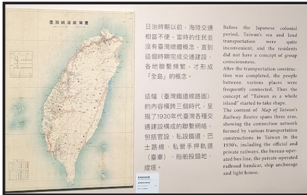
Image: This sign does something that would have never happened in the earlier narrative. It highlights Japanese colonialism in a positive light. It argues that Japanese colonialists helped create a Taiwanese identity by linking up the island's transportation network.

in Chinese history, common in the pre-1987 discourse (and still common today in China). 23