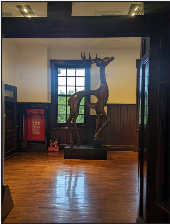
Image: Deer statue that was a birthday present to Chiang Kai-Shek.

Pondering this exhibit, I had trouble understanding why it was here. With the symbolism of the deer, it is apparent why the deer was given to Chi-