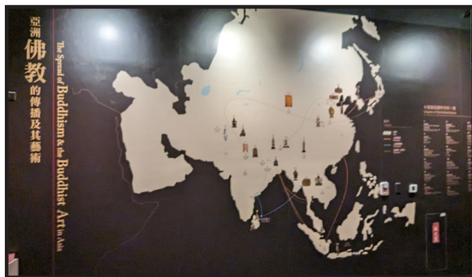
Image: Another exhibit at the NPM Southern Branch highlighting Asia rather than China.

before Taiwaneseization, curators in museums like the National History Museum (國立歷史博物館) foregrounded the Chinese aspects of Buddhism and situate artifacts in a Chinese identity by emphasizing the fact that they arrived in Taiwan via China.