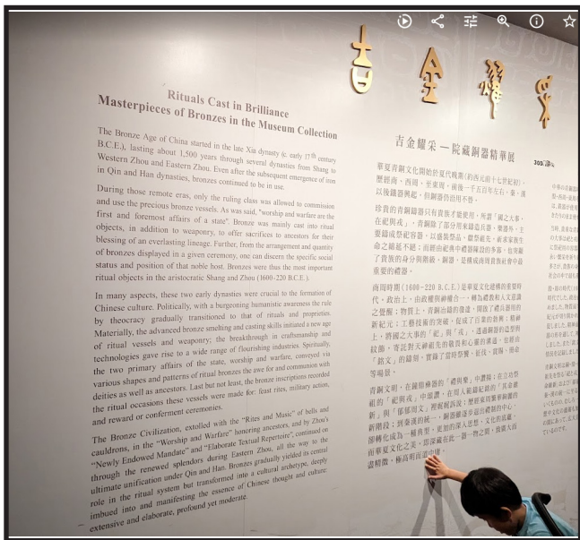
Image: This exhibit in the NPM's main branch highlights the narrative in museums which used to be ubiquitous in Taiwan, a China-centered narrative.

structs its narrative around a Chinese identity rooted in the deep history of China. Below is the text from the exhibit pictured above, located at the entrance of the exhibition of the collection of bronzes: