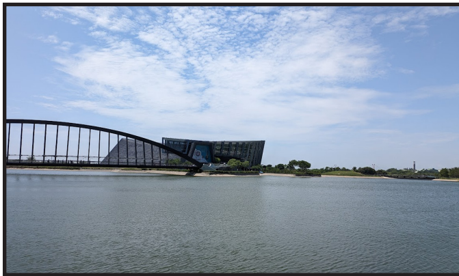
Image: The NPM Southern Branch is surrounded by a lake and a large pedestrian bridge.

The Jadeite Cabbage, long one of the most popular artifacts in the main branch of the NPM, was on display in the Southern Branch when I was conducting my research. Though it is impressionistic, my observations suggest that the Jadeite Cabbage was brought to the Southern Branch only as a way to encourage visitors to see the museum. When I was at the main branch of the NPM, I asked about the Jadeite Cabbage and the docent's resigned sigh was audible. It was clear that many in Taipei resented their loss of one of the most important works of art in Chinese history.