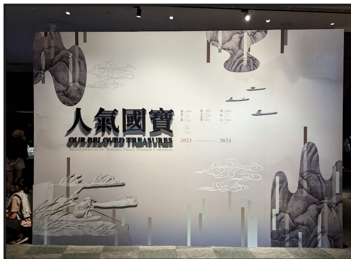
Image: The NPM Southern Branch’s most popular exhibit contains the Jadeite Cabbage and other artifacts.

Not all exhibitions in the Southern Branch escape the pull of the old narrative of Chineseness. After all, the Southern Branch’s collection is that of the NPM’s and the artifacts are therefore drawn from the collection of the Qing imperial houses. The first room that visitors enter after the ticket gate is a room that is similar in content to the main branch of the NPM. Discussions of Taiwan and Asia more broadly are absent from this exhibition room. The narrative in this first room, titled