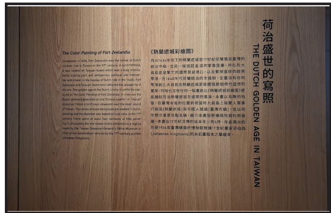
Image: Exhibit highlighting the history of Dutch colonization of Taiwan