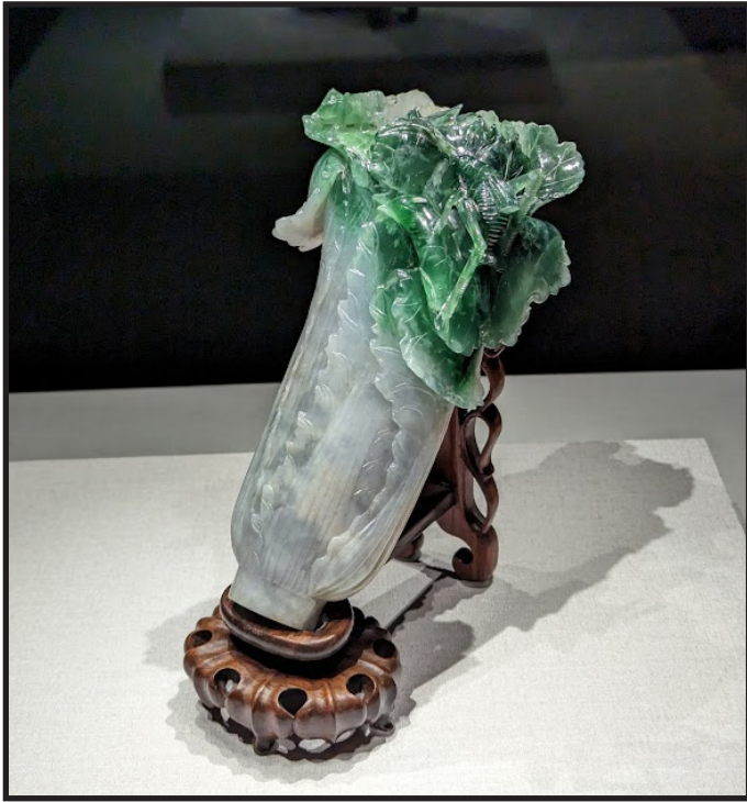
Image: The famous Jadeite Cabbage. When I visited this exhibit in 2013, it was held in the main branch and was crowded with people. Today it has been moved to the Southern Branch, partially in order to incentivize people to make the trip to the Southern Branch.

siders Gaze at Taiwan's Landscape and Products," while the Chinese subtitle is the more provocative "Taiwan's scenery in the eyes of the Imperialists Countries" (帝國眼中的台灣風物). 21 The exhibition shows how Dutch, Qing and Japanese imperialists depicted Taiwan.