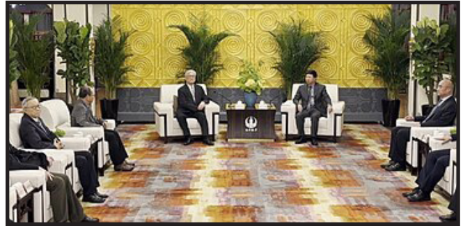
Image: KMT Vice-Chairman Andrew Hsia (left) meeting with CCP Taiwan Affairs Office Director Song Tao (right) in Shanghai in February 2024. 66

65 For example: Taiwan Affairs Office of the Central Committee of the Communist Party of China/Taiwan Affairs Office of the State Council, “刘结一会见中国国民党台商党代表联谊会参访团,” April 25, 2018, http://www.gwytb.gov.cn/xwdt/zwyw/201804/t20180425_11948558.htm ; Quanzhou Taiwan Business Investment Zone, “第十六届海峡论坛“泉台筑梦 智造未来”两岸融合发展系列活动首届两岸中小企业暨两岸征信论坛在泉州台商投资区举办,” June 17, 2024, http://www.qzts.gov.cn/zwgk/xwdt/tstzqdt/202406/t20240617_3047661.htm ; Taiwan Compatriots Home Network, “台湾青年联合会理事长何