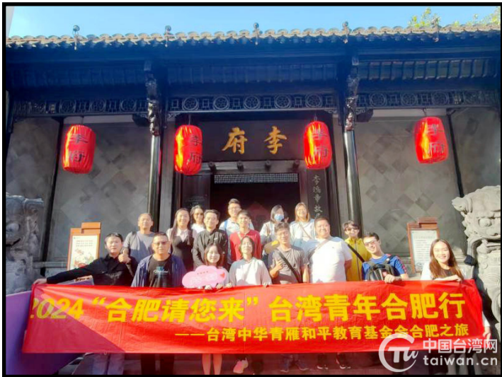
Image: Participants in an October 2024 trip to Hefei (Anhui Province, China) organized by the Chinese Cyan Geese Peace Education Foundation—an NGO associated with former KMT Chairwoman Hung Hsiu-chu, who is known for her outspoken pro-unification views and regular meetings with PRC officials. 50