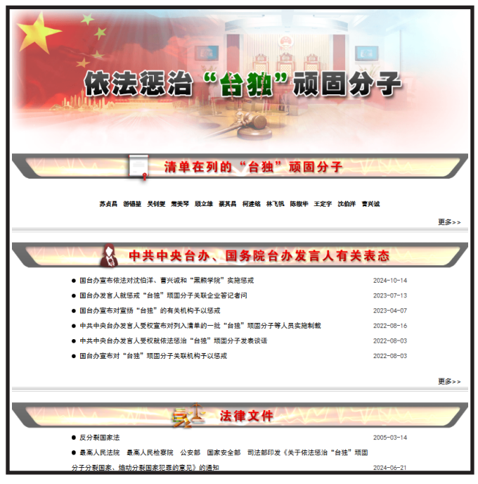
Image: A webpage posted by the PRC's Taiwan Affairs Office listing 12 Taiwanese individuals as "Taiwan independence elements."<sup>11</sup>

Besides the opinion on punishing Taiwanese activism, the State Council's Taiwan Affairs Office (國務院台灣事務辦公室) added a page on its official website titled "Punish Taiwan independence in accordance with the law" (依法懲治『台獨』頑固分子). The webpage listed "Taiwan independence